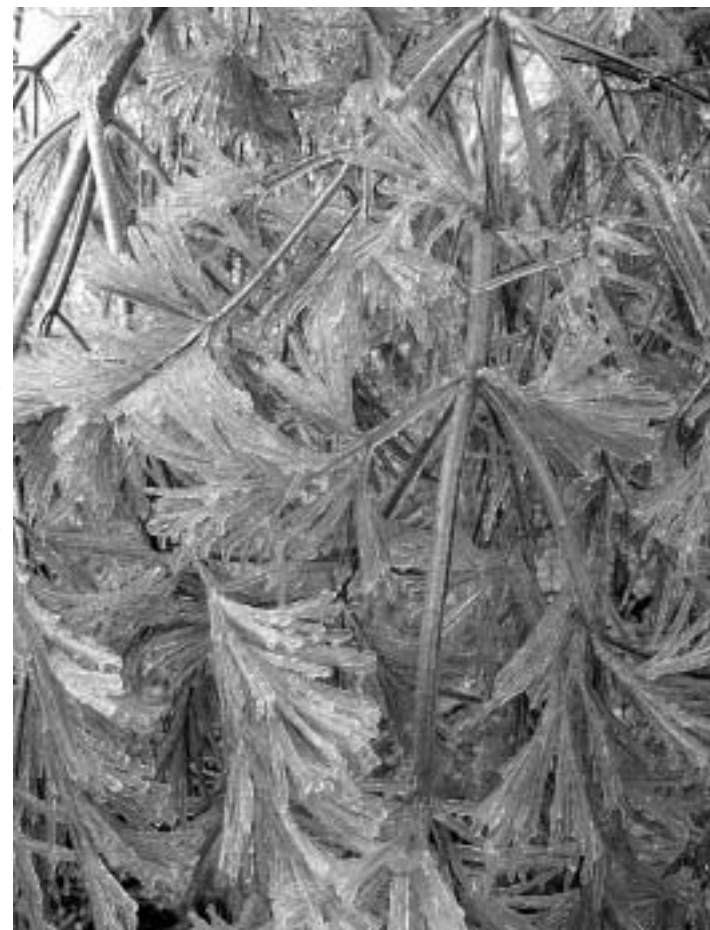
We were working on this issue of the Rooster when the Great Ice Storm of December '08 hit. The ice might be beautiful in pictures, but we all could have lived quite happily without the power outages and the sound of trees breaking in the night.

Dana Taylor, Road Agent, was in by request of the Selectmen, to go over